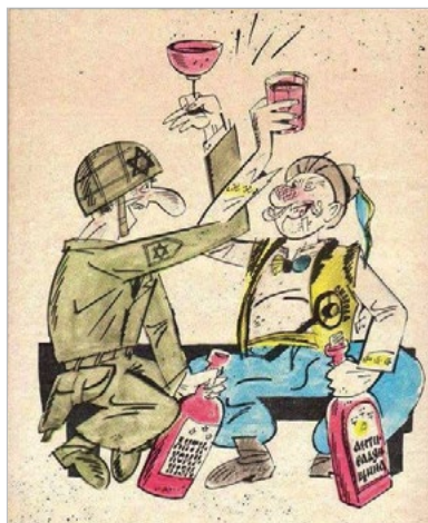
Illustration from the Soviet magazine Perets