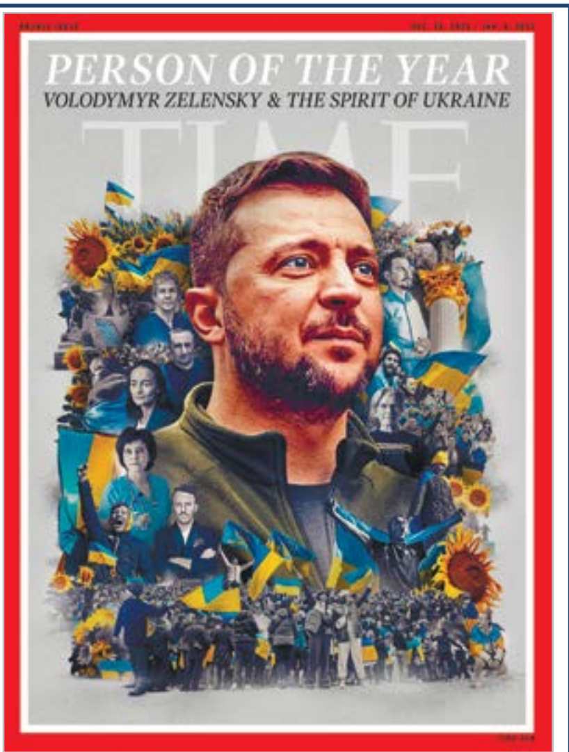
The American magazine Time awarded the title of "Person of the Year" to President Volodymyr Zelenskyi and the "spirit of Ukraine". This is stated on the publication's website.

clear that Ukraine's allies are in the civilized world. Those who were considered, if not "brothers", then good neighbors turned out to be enemies and detractors. This year, it is obvious that Ukrainians need Ukraine, they are ready to fight for it, give their lives and health, collect funds and not just survive – but lead a life and fight in unbearable conditions. It was this year that made many in our country and the diaspora remember their nationality and how much it meant. This is a very long year because it will actually end only with the end of the terrible war. When will the war come to an end? It is clear that no one can give reliable forecasts today. However, it was in December that the new Economist edition published conversations with the President of Ukraine Volodymyr Zelenskyi, Commander-in-Chief of the Ukrainian Armed Forces Valerii Zaluzhnyi, and the head of the Ground Forces Oleksandr Syrskyi. These interviews give ideas of how