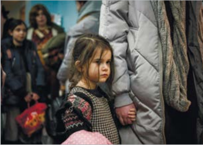
["Lost childhood..."] the beginning is on page 1

Unfortunately, not every Ukrainian child will be able to celebrate the long-awaited holidays with their families this year. Thousands of Ukrainian children will not celebrate the New Year in Ukraine, because they live on enemy land.