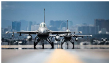
The United States USA

The United States announced a $150 million military aid package for Ukraine. The Ukrainian Armed Forces will receive, among other things, additional air defense interceptors, artillery and other firepower, as well as anti-tank weapons. The package includes: