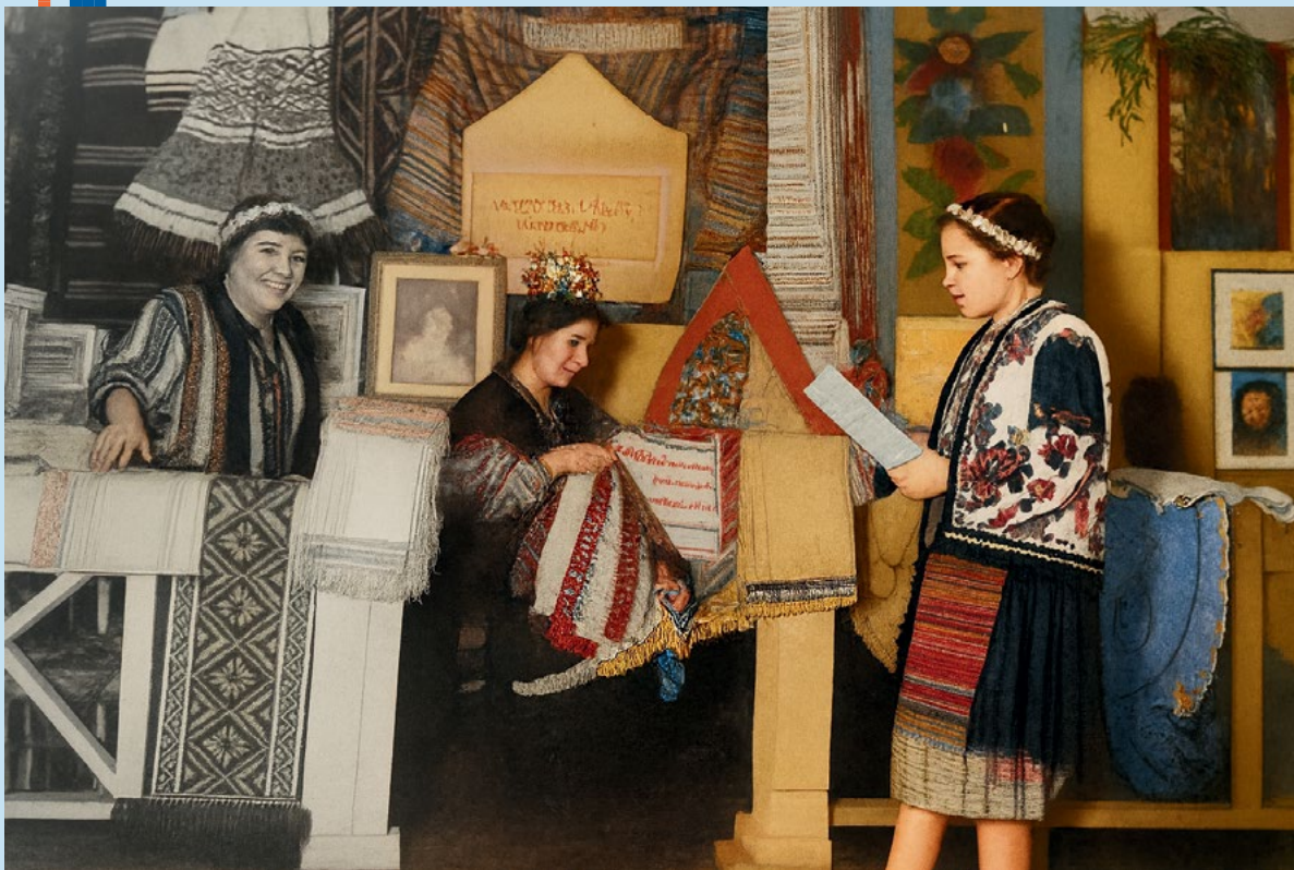
Soyuzianky at an exhibition stand dedicated to Ukrainian folk art, 1926. Artistically enhanced using artificial intelligence.