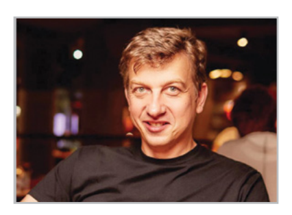
Oles Doniy – Ukrainian journalist, TV presenter, politician, public and cultural figure.